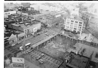
Left: International Hotel site after demolition in 1979.

Francisco city government following the tumultuous eviction of tenants. In response to public outcry over the 1979 demolition of the I-Hotel, Mayor Feinstein established the International Hotel Block Development Citizens Advisory Committee (IHCAC) to make recommendations concerning the future of the site. In 1982, at the urging of the IHCAC, the San Francisco Board of Supervisors passed a zoning ordinance that required housing on the I-Hotel location.