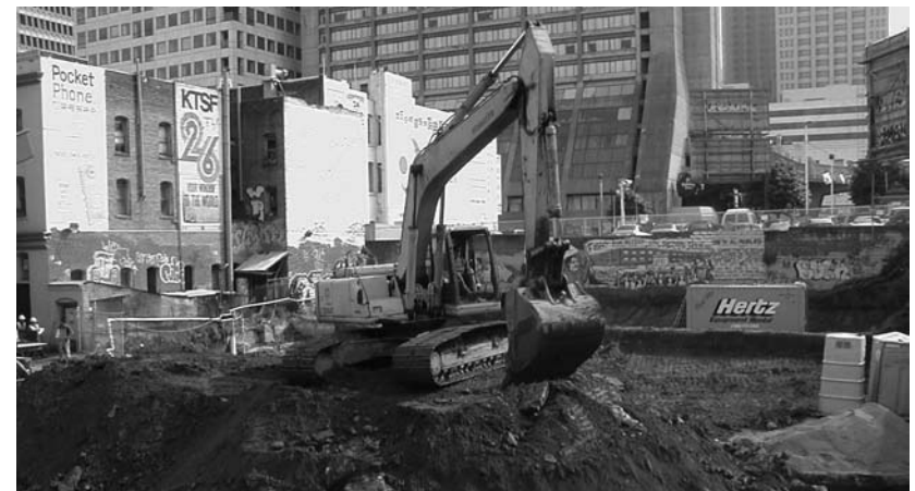
Top: Construction begins in 2002.