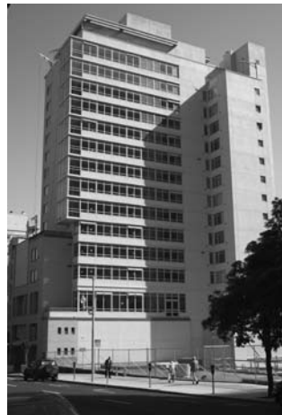
Top: Bill Sorro examines the new International Hotel Senior Housing rooftop garden.