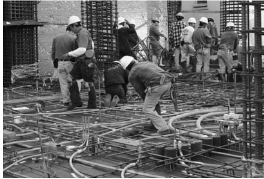
Construction workers build the new I-Hotel.

1994: HUD awards $8.3 million grant to co-sponsors Chinatown Community Development Center (CCDC) and Kearny Street Housing Corporation (incorporated body of IHCAC) to build affordable senior housing.