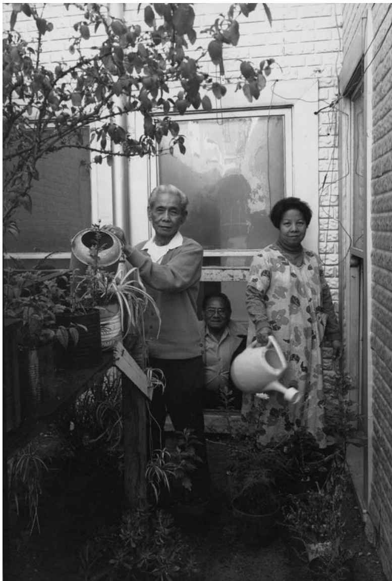
Tenants at the International Hotel's Skylight Garden, 1977