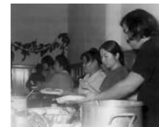
Volunteers serving I-Hotel tenants