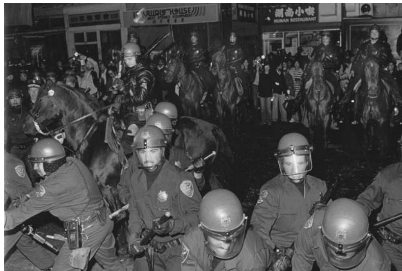
Eviction night, August 4, 1977.

Affordable housing on the site would not have occurred if not for the efforts of community members, who maintained constant pressure on San