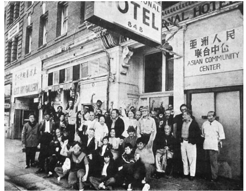
International Hotel tenants, staff and volunteers, circa 1970s

In 2006, the International Hotel Senior Housing, Inc. Board of Directors established the International Hotel History Committee with the charge of memorializing the history of the International Hotel and the community struggle to protect low-income housing. The History Committee worked from 2006 to 2010 to develop a timeline and this brochure. The committee's work entailed the interviewing of key parties to capture this history from the struggle of tenants against eviction to the re-opening of the International Hotel.