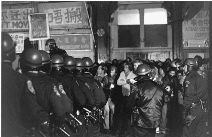
On eviction night, International Hotel supporters linked arms in a human barricade against police, August 4, 1977.